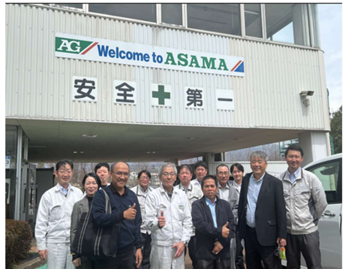
※April 11, 2025 at Asama Giken Kogyo Co.

SapuraIndustrial Website: https://www.sapuraIndustrial.com.my/